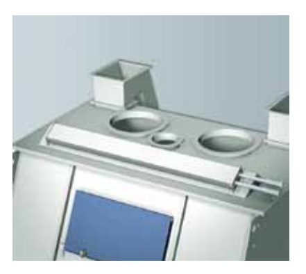
Fig.4 New liquid application device