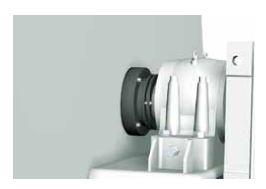
Fig.5 Assembly type shaft end seal applied

The double full-length bottom gates ensure a complete discharge of the mixer content within seconds, hardly any residues. In addition, the adjustable paddles allow it to optimize the gap between paddle and mixer housing to diminish residues on the inner wall, avoiding cross contamination between different formulations. Besides, no ingredient can escape from shaft ends to the neighborhood environment, thanks to the excellent leak-proofing performance of the unique assembly type shaft end seal invented (see Fig.5).