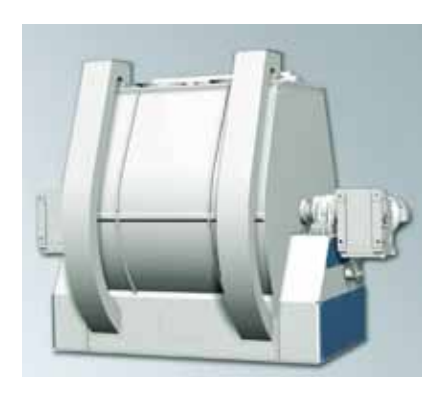
Fig.3 Double air-return ducts

> A newly designed liquid application device with enhanced atomizing performance enables the mixer to achieve a very homogenous result and can mix liquids with powder ingredients without aggregation. (See Fig.4).