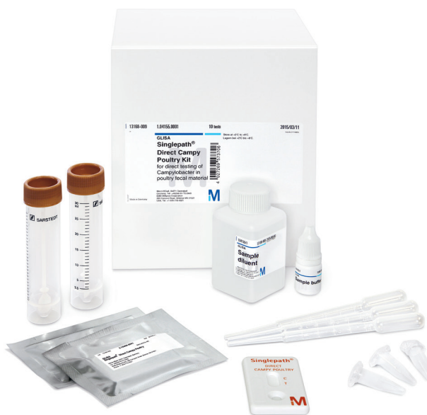
Fig. 3: The Singlepath® Direct Campy kit includes everything needed for on-site testing.

The Singlepath® Direct Campy Poultry kit for rapid point of use immunological screening of Campylobacter requires no prior enrichment step and delivers results within two hours. By elimination of the extended enrichment step, the speed of the test enables screening immediately prior to slaughter. This allows financially relevant logistical decisions, such as the separation of Campylobacter high-risk (> 10 7 CFU per g of feces) and low-risk flocks for slaughter, to be made on the basis of up-to-date information.