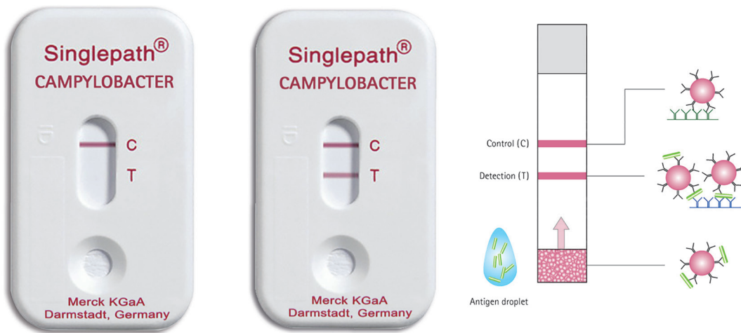
Fig. 1 (left – single line): Singlepath® negative test result.

Singlepath® lateral flow tests for the detection of Campylobacter allow the poultry industry to identify the presence of contamination much faster, enabling a more effective and timely response. Tests are optimized for use both on the farm and at the processing facility, from on-site pre-screening to release testing. The tests deliver reliable results without the need for expensive instrumentation or trained staff. Results are clearly displayed in a yes/no format within 20 minutes after sample application.