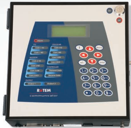
Quickly collect comprehensive data with the Rotem Communicator