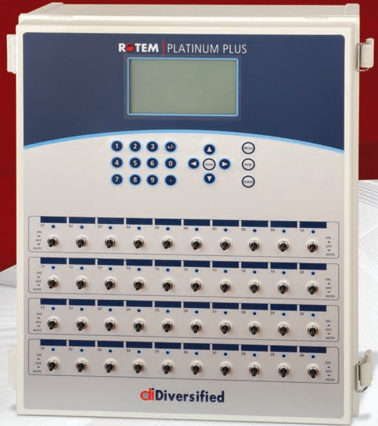
Platinum Plus, a first class controller with minimum programming