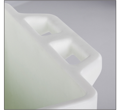
Ergonomically designed handles.