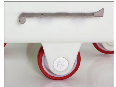
Integrated stainless steel brackets.