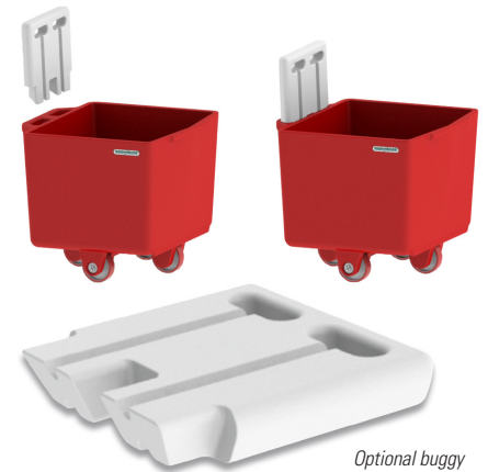
Optional buggy handle available